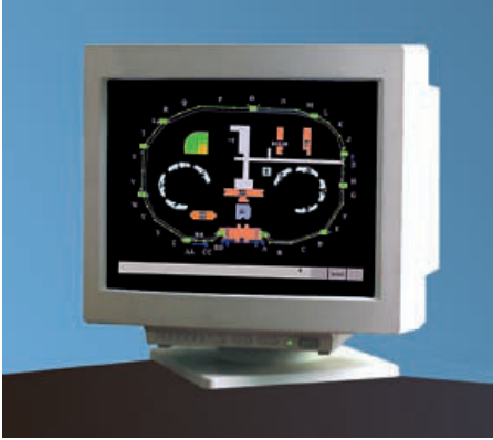
INTREPID™ Map Monitor for precise intrusion location and alarm reporting.