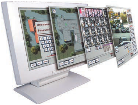
Perimeter Security Manager for complete perimeter control.

MicroPoint Cable's major components are the Processor Module, MicroPoint™ cable and Windows® software. The Processor Module provides the system intelligence to perform powerful signal processing, DC power distribution and data communications networking. The MicroPoint cable permits easy connection of the perimeter system and provides DC power, data communication for alarms and control, and intrusion detection capabilities. Site Manager software provides site design, installation, and service capabilities.